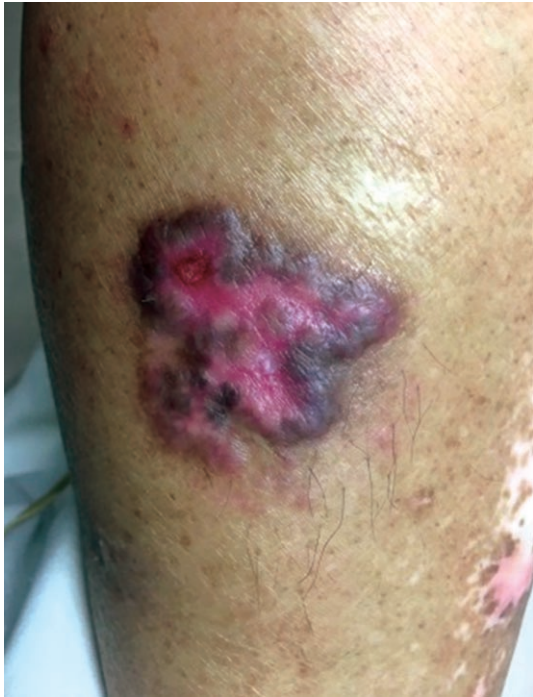
Figure 1. A violaceous plaque over left shin of the patient.

A 55-year-old woman presented with pruritic violaceous flat-topped papules and plaques over her legs for few years. She also complained of changes over her lips (Figures 1&2). She enjoyed good past health and denied any drug use. Histology shows features of lichen planus, including dense band-like lymphocytic infiltrate at