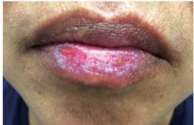
Figure 2. Lacy-white reticular lesions are shown on the patient's lower lips.

the dermal-epidermal junction and presence of apoptotic keratinocytes along the basal layer (Figure 3).