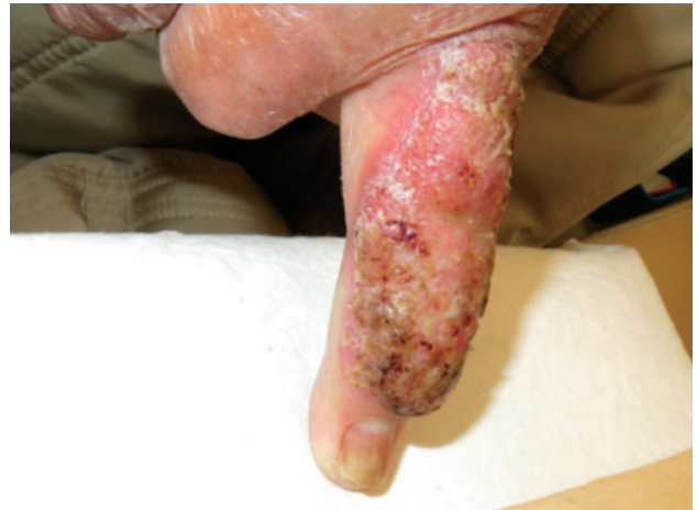
Figure 1. A hyperkeratotic plaque over the right middle finger.

An 86-year-old male presented with a one year history of a hyperkeratotic plaque over the right middle finger. The lesion was non-itchy and non-tender, but had increased in size gradually (Figure 1). There was no previous history of trauma over the right middle finger and the rest of the skin was unremarkable. He had a history of minimal change glomerulonephritis, ischaemic heart disease and hypothyroidism. His drug history included prednisolone, azathioprine, thyroxine, aspirin, simvastatin, atenolol, perindopril and amlodipine. Skin scraping over the right middle finger for fungal culture was negative. A biopsy was done on the right middle finger (Figure 2).